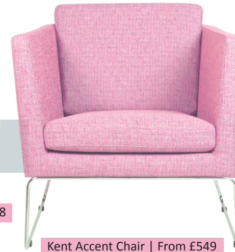
Kent Accent Chair | From £549