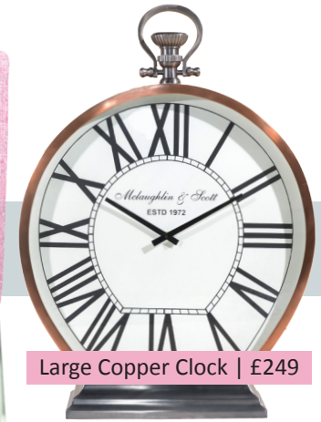
Large Copper Clock | £249

as this large copper clock. We're also beginning to see the use of mixed metals so don't be afraid to use copper, gold and silver together. When using bold, decorative pieces, be sure to allow space to flow around them to help bring the object to life.