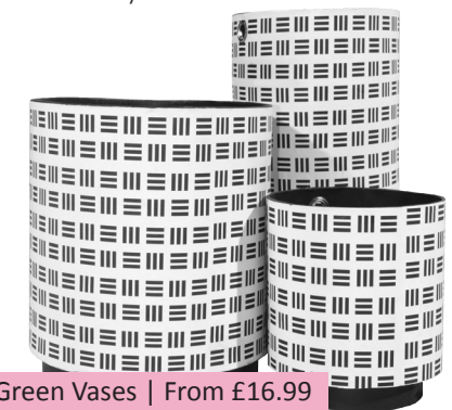
Made Green Vases | From £16.99

Visit us in store online at www.valeinteriors-surrey.co.uk